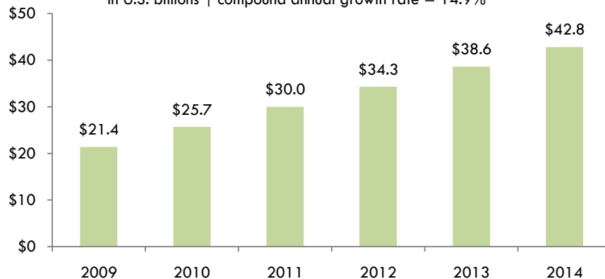
Projected Global Smart Grid Market Size, 2009 - 2014 in U.S. billions | compound annual growth rate = 19.9%